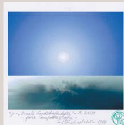
EDITH SUCHODREW, UNREAL LANDSCAPE IDYLL N° 20599, 1999 COMPUTER GRAPHIC